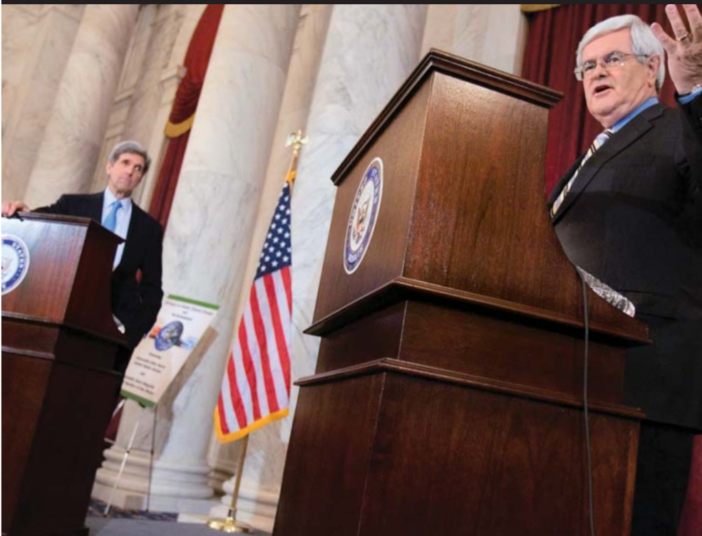
BELOW: FORMER SPEAKER OF THE HOUSE NEWT GINGRICH (R-GA) DEBATES GOVERNMENT ACTION ON CLIMATE CHANGE WITH SENATOR AND 2004 PRESIDENTIAL CANDIDATE JOHN KERRY (D-MA) AT AN EVENT SPONSORED BY THE JOHN BRADEMANS CENTER FOR THE STUDY OF CONGRESS IN THE ROBERT F. WAGNER GRADUATE SCHOOL OF PUBLIC SERVICE.

TOP-DRAW ALUMNI AND FRIENDS PUT ON THE GLITZ FOR NYU