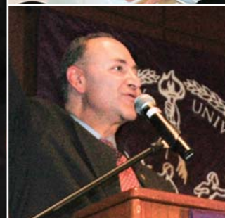
ABOVE: CHEF-RESTAURATEUR EMERIL LAGASSE OFFERS ADVICE AT THE INTERNATIONAL HOSPITALITY INDUSTRY INVESTMENT CONFERENCE; SENATOR CHARLES SCHUMER (D-NY) SPEAKS ABOUT HIS RECENT BOOK, POSITIVELY AMERICAN .