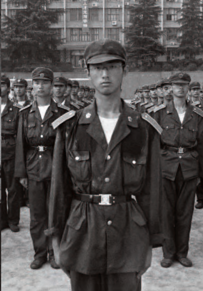
CLOCKWISE FROM ABOVE: A KARAOKE BAR IN JISHOU CITY; UNIVERSITY FRESHMEN, SOME OF WHOM WERE THE PHOTOGRAPHER'S ENGLISH STUDENTS, DRILL DURING COMPULSORY MILITARY TRAINING; A YOUNG MAN DISTRAUGHT OVER HIS GIRLFRIEND IS RESTRAINED MOMENTS AFTER ATTEMPTING SUICIDE.