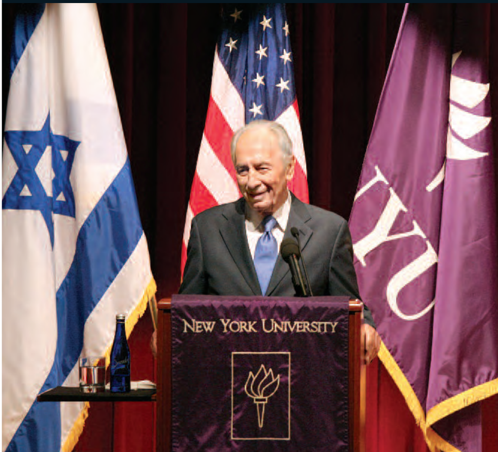
THE NINTH PRESIDENT OF THE STATE OF ISRAEL AND WINNER OF THE NOBEL PEACE PRIZE SHIMON PERES DELIVERS AN ADDRESS, "THE GLOBALIZATION OF PEACE," AT VANDERBILT HALL.