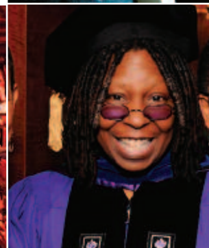
WHOOPI GOLDBERG ADDRESSES STUDENTS AT THE TISCH SALUTE.