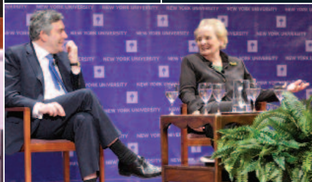
BRITISH PRIME MINISTER GORDON BROWN AND FORMER U.S. SECRETARY OF STATE MADELEINE ALBRIGHT DISCUSS MULTILATERALISM AS A SOLUTION TO GLOBAL CRISES.