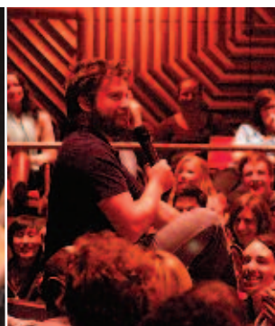
COMEDIAN ZACH GALIFIANAKIS PERFORMS STAND-UP AT SKIRBALL.