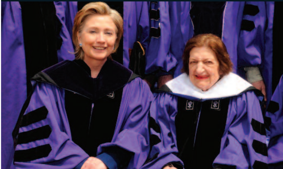
FORMER NEW YORK SENATOR AND CURRENT SECRETARY OF STATE HILLARY CLINTON AND WHITE HOUSE PRESS CORPS VETERAN HELEN THOMAS RECEIVE HONORARY DEGREES DURING THE 2009 COMMENCEMENT CEREMONY AT YANKEE STADIUM.