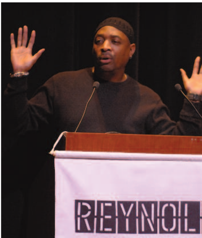
PUBLIC ENEMY FOUNDING MEMBER CHUCK D RAPS ABOUT SOCIAL ENTREPRENEURSHIP AND ART AS PART OF A REYNOLDS PROGRAM SPEAKER SERIES.

TOP-DRAW ALUMNI AND FRIENDS PUT ON THE GLITZ FOR NYU