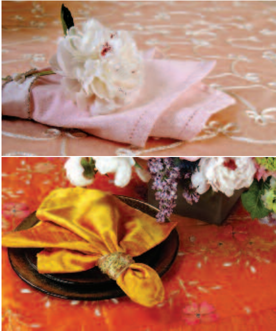
THE COUNTLESS STYLES OF TABLE DECOR AT MAGNOLIAS LINENS INCLUDE PINK FUSILI (TOP) AND ORANGE GALORE (BOTTOM), WHICH IS MADE WITH HAND-PAINTED SILK.