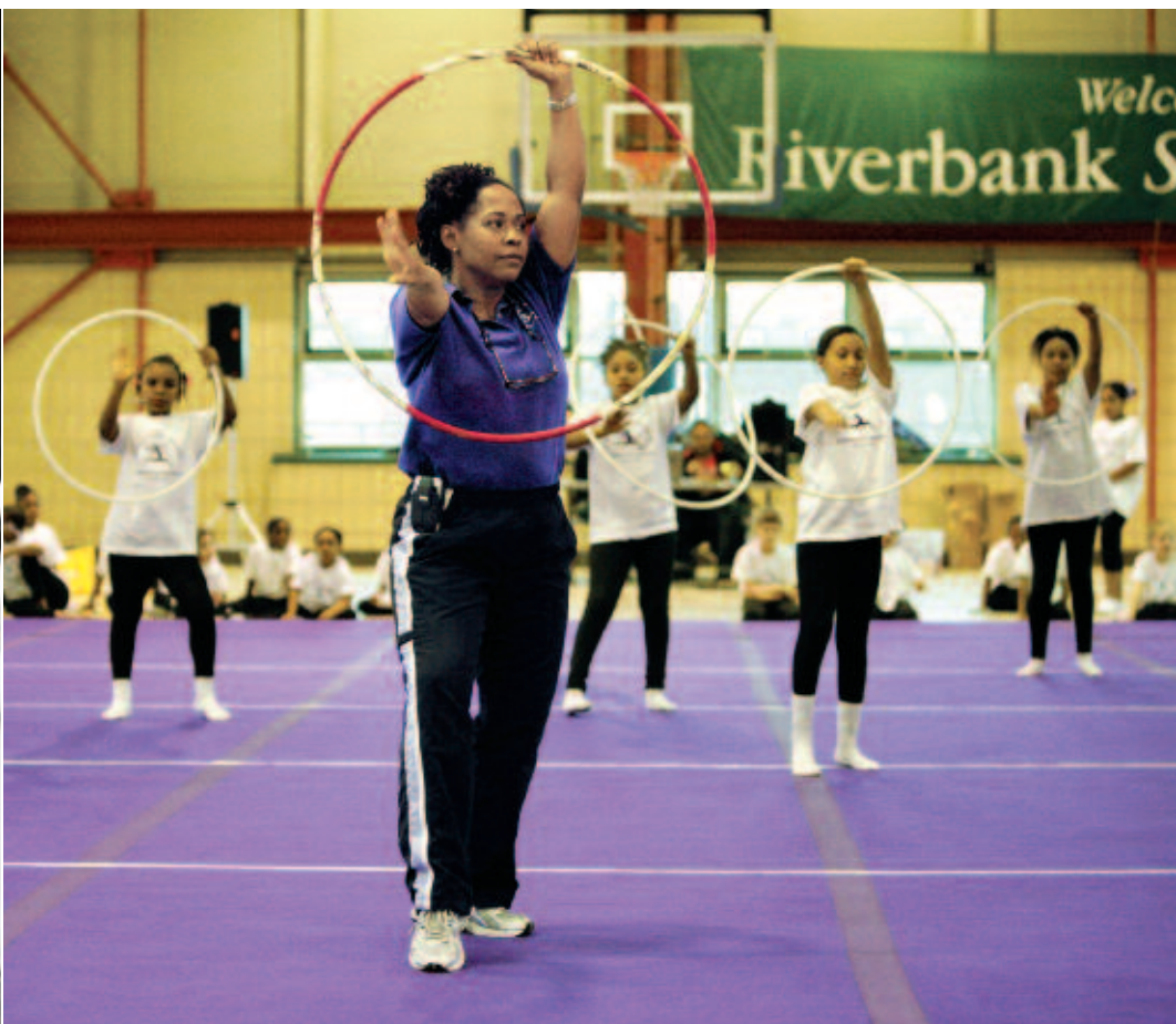
IN 1978, HILLIARD BECAME THE FIRST AFRICAN-AMERICAN TO REPRESENT THE UNITED STATES IN RHYTHMIC GYMNASTICS AND WAS INDUCTED INTO THE GYMNASTICS HALL OF FAME 30 YEARS LATER. TODAY, THROUGH HER FOUNDATION, SHE TEACHES FREE CLASSES TO CHILDREN FROM LOW-INCOME NEIGHBORHOODS.