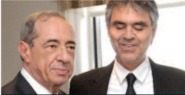
OPERA STAR ANDREA BOCELLI (RIGHT) SANG "HAPPY BIRTHDAY" TO FORMER NEW YORK GOVERNOR MARIO CUOMO AT A RECEPTION HONORING THE RENOWNED TENOR WITH THE NYU PRESIDENTIAL CITATION.