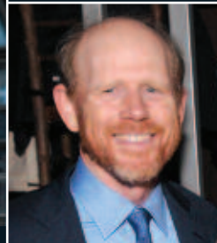
RON HOWARD WAS HONORED AT THE TISCH GALA.