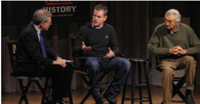
ACTOR MATT DAMON AND THE LATE HISTORIAN HOWARD ZINN (WSC '51) DISCUSSED THEIR HISTORY CHANNEL FILM ON U.S. SOCIAL CHANGE, THE PEOPLE SPEAK .