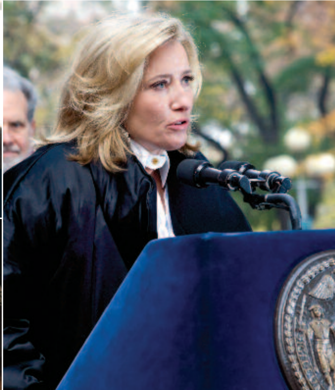
OSCAR-WINNER EMMA THOMPSON HELPED OPEN "JOURNEY," AN ART INSTALLATION SET UP OUTSIDE WASHINGTON SQUARE PARK THAT TELLS THE STORY OF A WOMAN TRAFFICKED INTO SEXUAL SLAVERY.