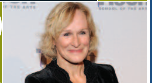
EMMY-WINNING ACTRESS GLENN CLOSE FOR THE CAMERAS AT THE 2009 TISCH GALA.