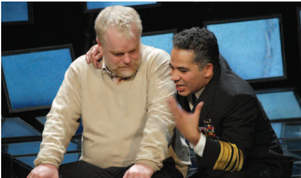
PHILIP SEYMOUR HOFFMAN (TSOA '89) AND JOHN ORTIZ WENT HEAD-TO-HEAD AS IAGO AND OTHELLO, RESPECTIVELY, IN THE PUBLIC THEATER'S CONTEMPORARY TAKE ON THE SHAKESPEARE CLASSIC, WHICH PREMIERED AT NYU'S SKIRBALL CENTER FOR THE PERFORMING ARTS.