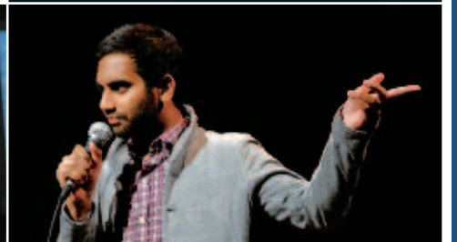
ACTOR AND COMEDIAN AZIZ ANSARI (STERN '04) PERFORMED STAND-UP AT THE SKIRBALL CENTER.