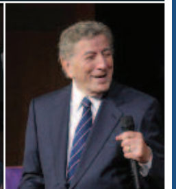
TONY BENNETT CROONED AT THE KIMMEL CENTER.