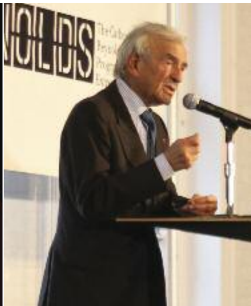
HOLOCAUST SURVIVOR AND NOBEL PRIZE-WINNER ELIE WIESEL LED THE REYNOLDS SPEAKER SERIES.