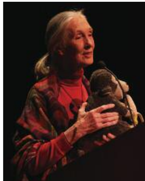
JANE GOODALL SPOKE AT STEINHARDT'S SCIENCE EDUCATION INNOVATORS EXPO & SYMPOSIUM.