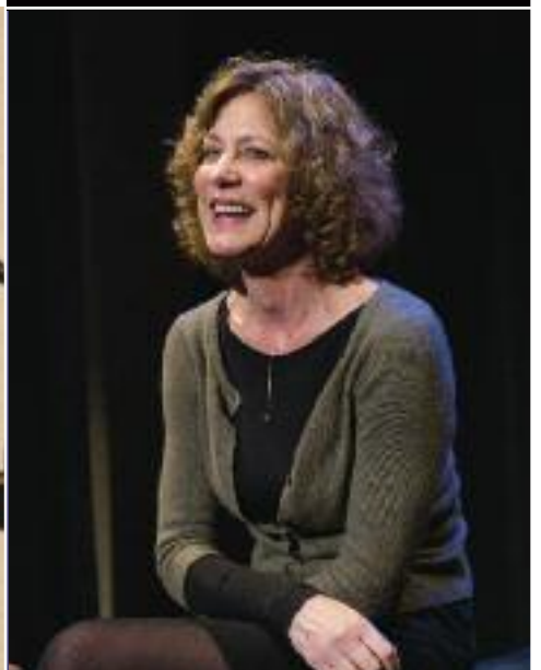
ACTRESS CHRISTINE LAHTI CONDUCTED A SCENE STUDY WORKSHOP FOR STUDENTS AT THE GALLATIN SCHOOL.