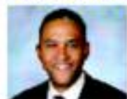
THE HONORABLE RAYMOND J. LOHIER (LAW '91)

EUGENE J. KEOGH AWARD FOR DISTINGUISHED PUBLIC SERVICE