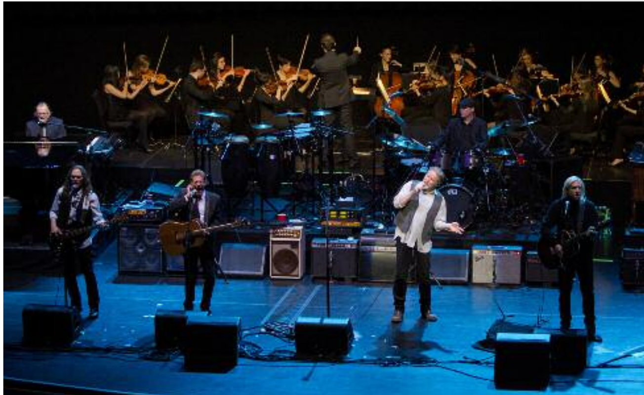
THE EAGLES—WHO HAVE SOLD MORE THAN 120 MILLION ALBUMS—ROCKED THE BEACON THEATRE DURING THE FIRST ANNUAL STEINHARDT VISION AWARD GALA. (SEE PAGE 13 FOR A Q&A WITH MUSICIAN GLENN FREY ON HIS NEW GIG TEACHING AT NYU.)

TOP-DRAW PERSONALITIES SPOTTED ON CAMPUS