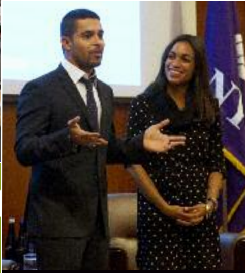
ACTOR/ACTIVISTS WILMER VALDERRAMA (LEFT) AND ROSARIO DAWSON AT A VOTO LATINO EVENT SPONSORED BY THE NYU MULTICULTURAL ALUMNI GROUP.

TOP-DRAW PERSONALITIES SPOTTED ON CAMPUS